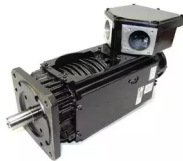
USAIKM-50-BK33 AC Servo Motor