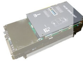
D22 or 1006-1232 VACIII-Drive Unit